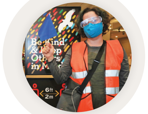
Between January 12 and February 26, 2021, Swedish administered nearly 87,000 vaccinations at its clinics in response to the state's call, with approximately 48,000 given at the SU site. Nearly one-fifth of the Swedish volunteers were affiliated with the university.

one-fifth of the Swedish volunteers were affiliated with the university.