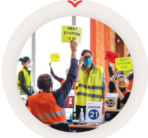
Much of the first floor of Campion Hall was home to the Swedish Community COVID-19 Vaccination Clinic at SU, a unique collaboration between the two longtime partners in health care education. The two institutions worked quickly to bring the clinic to fruition—only two weeks from decision to implementation.