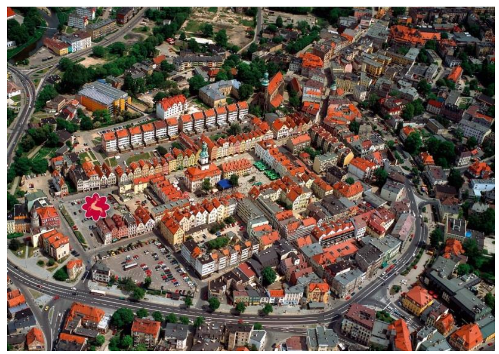
Jelenia Góra from above

http://en.jeleniagora.pl/content/welcome