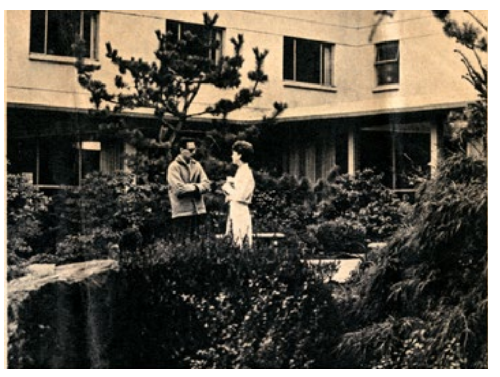
Fujitaro Kubota's garden outside of Xaveir Hall. Photograph by Sean Malone, 1966.