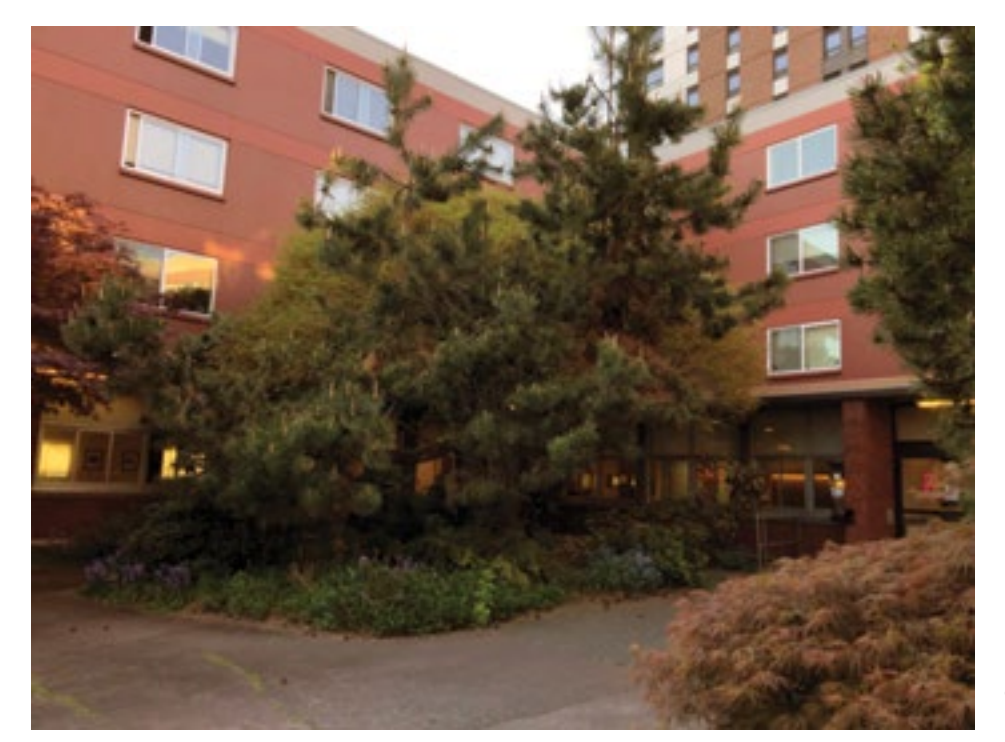
Kubota's garden outside of Xaveir Hall. Photograph by Amelia Delgado, 2021.