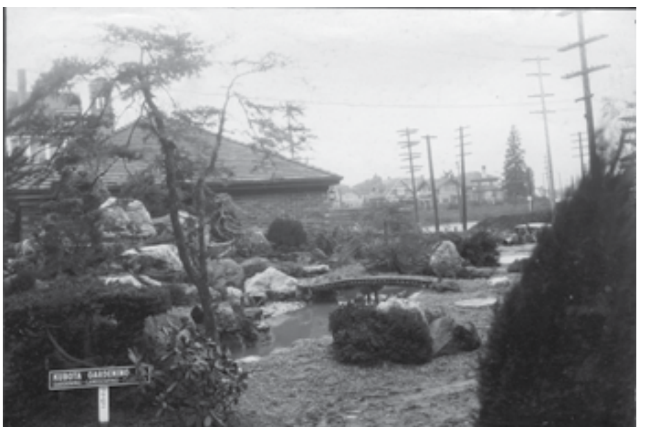
Bridge in a garden with a Kubota Gardening Company sign, 1926.