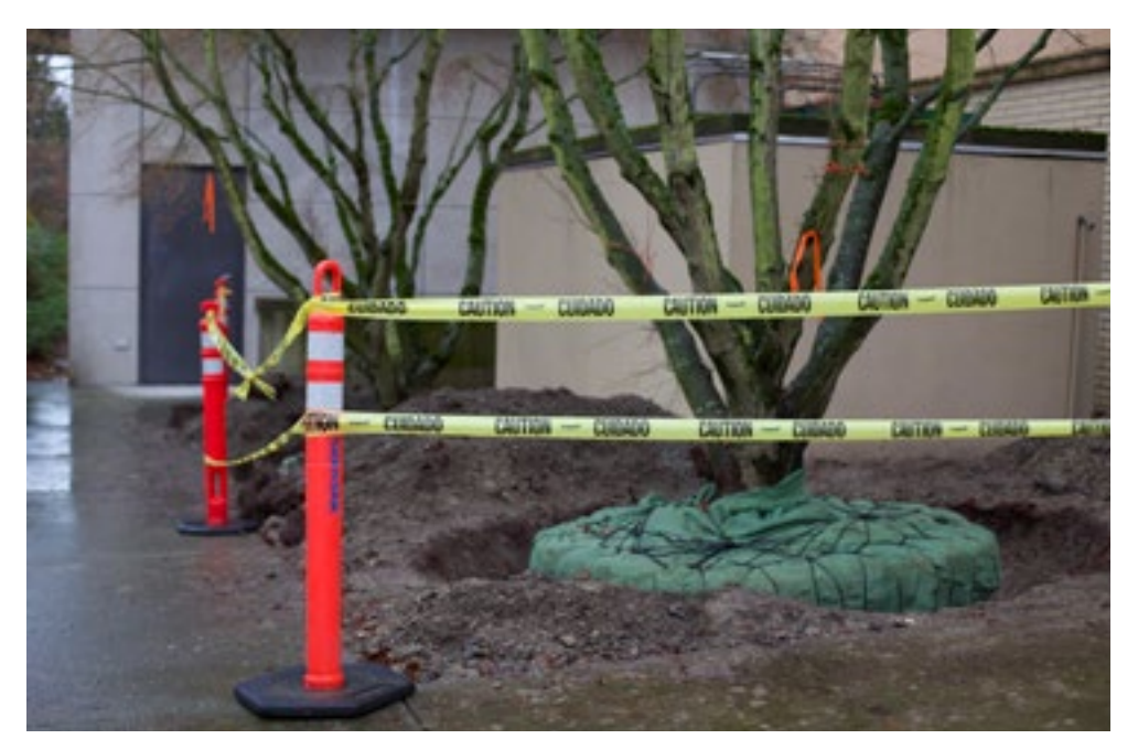
Trees ready to be transplanted from the Kubota Garden at the previous University Services building to the Union Green.