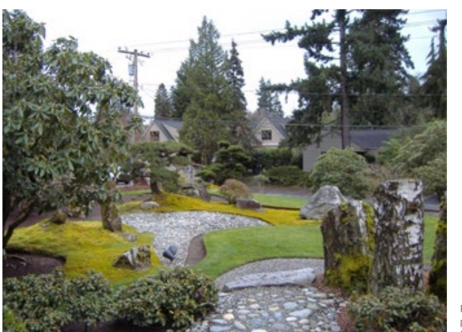
Front yard of home from recent project.