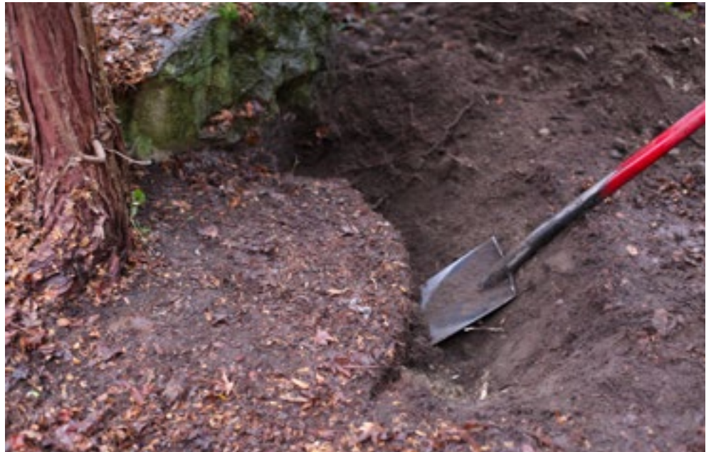
The digging of a root bulb from the Kubota Garden at the previous University Services building.