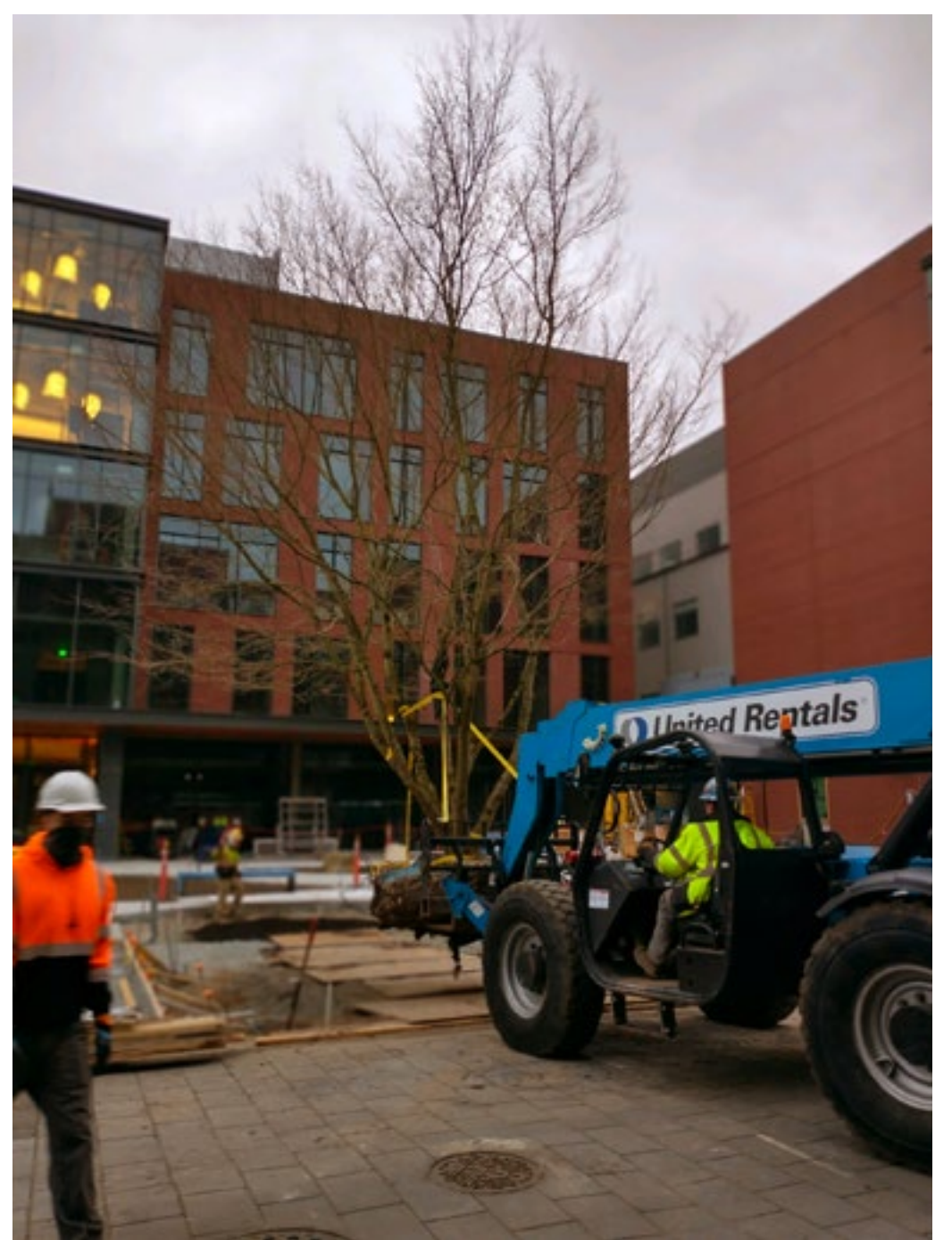
The moving the first Green Leaf Japanese maple tree to the new Kubota Legacy Garden, 2021. Photograph by S.S. landscape worker, edited by Amelia Delgado.