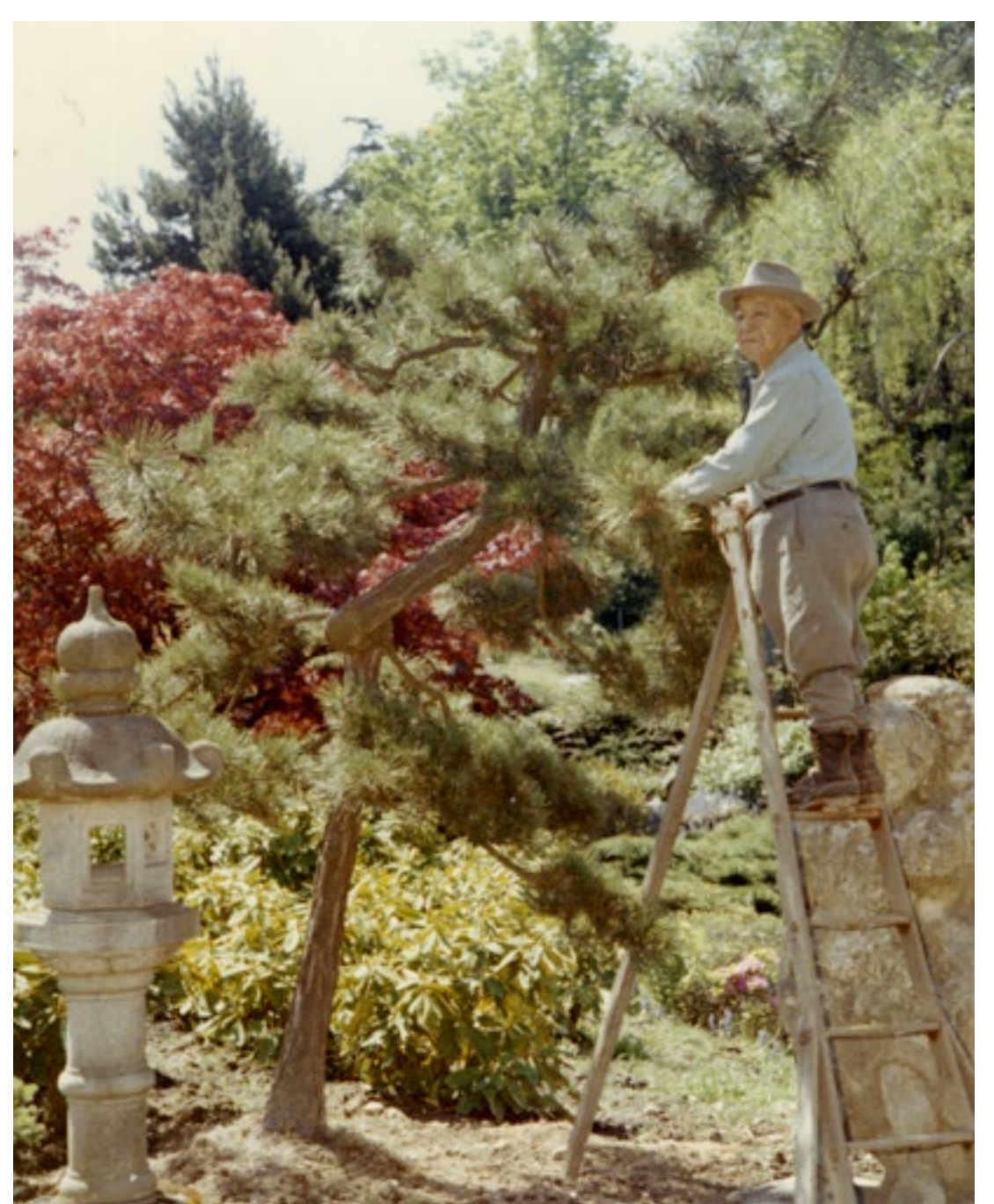
Fujitaro Kubota on a ladder working on a tree in the garden, 1962.